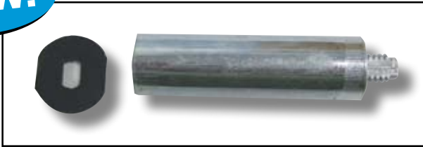
*Gasket sold separately