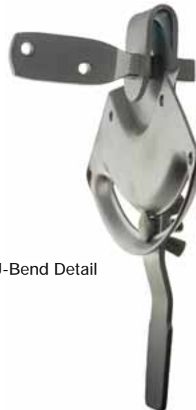
Reverse U-Bend Detail