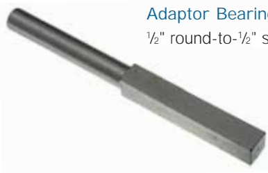
Adaptor Bearing Pin

1/2" round-to-1/2" square x 6" long zinc-plated steel, used for control arms.