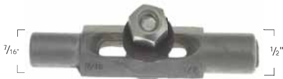
Slide Bearing Pin